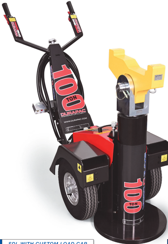
SDL WITH CUSTOM LOAD CAP

THE SD-ACCESSORIES ARE DESIGNED TO SUIT THE COMPACT SAFE D LOCK JACK AND IT'S EXTENDED FAMILY OF JACKS. THIS INCLUDES THE POWERDRIVE , EXTRA COMPACT, TALLEST, SLIMLINE & SDN-SERIES JACKS & DJS-SERIES JACK STANDS.